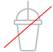
NO Drink Cups