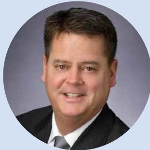
Greg Ress Tuscarawas County Commissioner