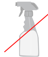
NO Spray Bottles