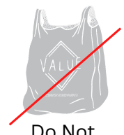
Do Not Bag Recyclables (no trash)