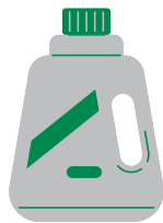
Laundry Detergent Jugs and Bleach Jugs