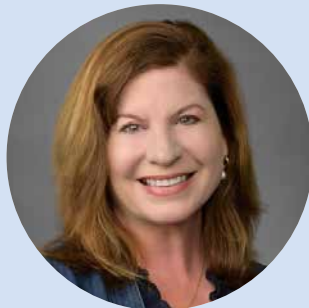
Kristin Zemis Tuscarawas County Commissioner