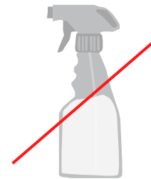
NO Spray Bottles