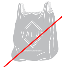
Do Not Bag Recyclables (no trash)