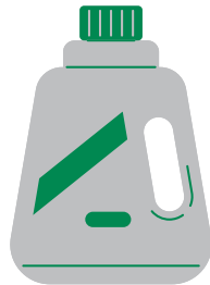
Laundry Detergent Jugs and Bleach Jugs