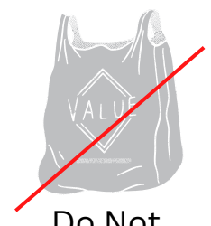
Do Not Bag Recyclables (no trash)