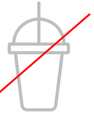
NO Drink Cups