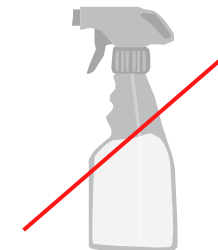
NO Spray Bottles